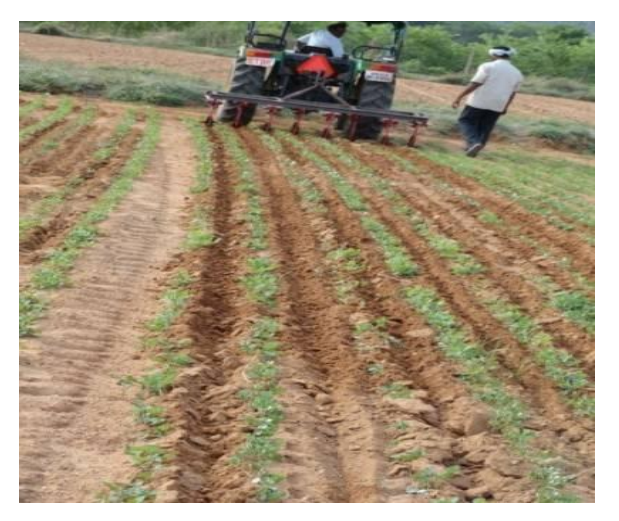
Tractor drawn intercultivation implement

This is a 8 row tractor operated inter-culture implement used for weeding in groundnut crop developed at Agricultural Research Station, ANGRAU, Ananthapure. Its frame is provided with 8 tynes each tyne attached with T or V-shape sweeps to work in between 30 cm row spacing of the crop without any plant damage. Two small width pneumatic tyres of 8.3 X 28 "size need to be fitted to the rear axle of the tractor to run in between rows of the crop instead of normal size tyres to prevent trampling of plants under the tyres. The size of the seeps range from 4" to 6 ". The cost of inter-culture implement and pneumatic tyres with sweeps is approx. Rs.45, 000. Its field capacity is 4 to 5 ha/day.