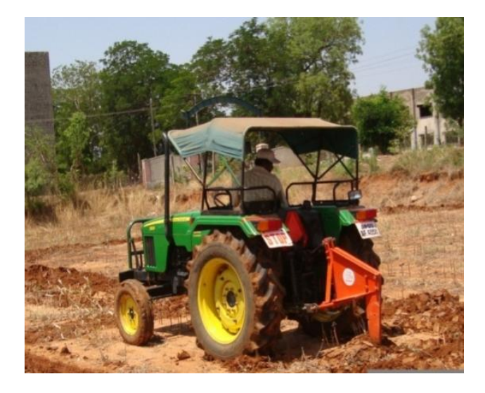
1.3 Sub soiler