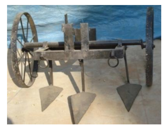
Bullock drawn intercultivati on equipment

It is a 4 row bullock drawn inter-culture implement used for removal of shallow depth weeds in between rows of groundnut crop. It consists of 4 straight blades, frame, handle and beam to attach with a pair of bullocks. The blades are fixed to the frame to which handle is attached. The blades are the working components which are made from medium carbon steel or mild steel for more strength to resist soil friction and to have long life. The width of each blade is 15 cm. for operation, the weeder is passed in between the rows of crop so the blades cut and uproot the weeds. Its field capacity is 2.0 ha/day.